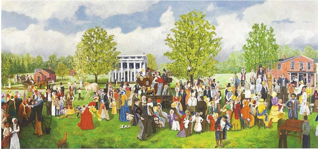
Hugh C. Humphreys; Come Join the Abolitionists ; 40 x 84 inches; acrylic on gessobord National Abolition Hall of Fame and Museum, Peterboro, New York