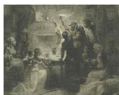
Reading the Emancipation Proclamation by artist J.W. Watts in 1864 (Schomburg Center for Research in Black Culture)

For more information: www.NationalAbolitionHallofFameandMuseum.org , www.PeterboroNY.org , 315.308.1890. For status of the program, due to weather, call 315.308.1890 after 1 p.m. Saturday, December 30, 2023